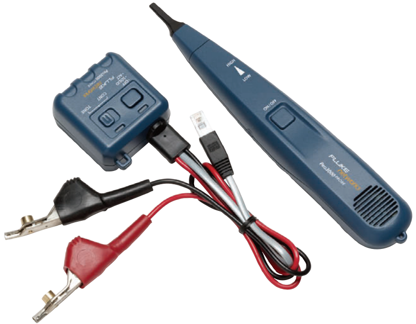
Pro3000 Toner and Probe

The Pro3000 Analog Tone and Probe are your best choice for toning and tracing wire on non-active networks, and specifically for identifying individual pairs with SmartTone™ technology. Angled bed-of-nails clips allow easy access to individual wires, and the RJ11 connector is ideal for use on telephone jacks. The large loud speaker on the probe allows you to hear through drywall, wood or other enclosures to find wires quickly and easily. You can send this loud tone up to 10 miles on most cables! Attach the nylon pouch to your belt, and you will be equipped for any wire identification job.